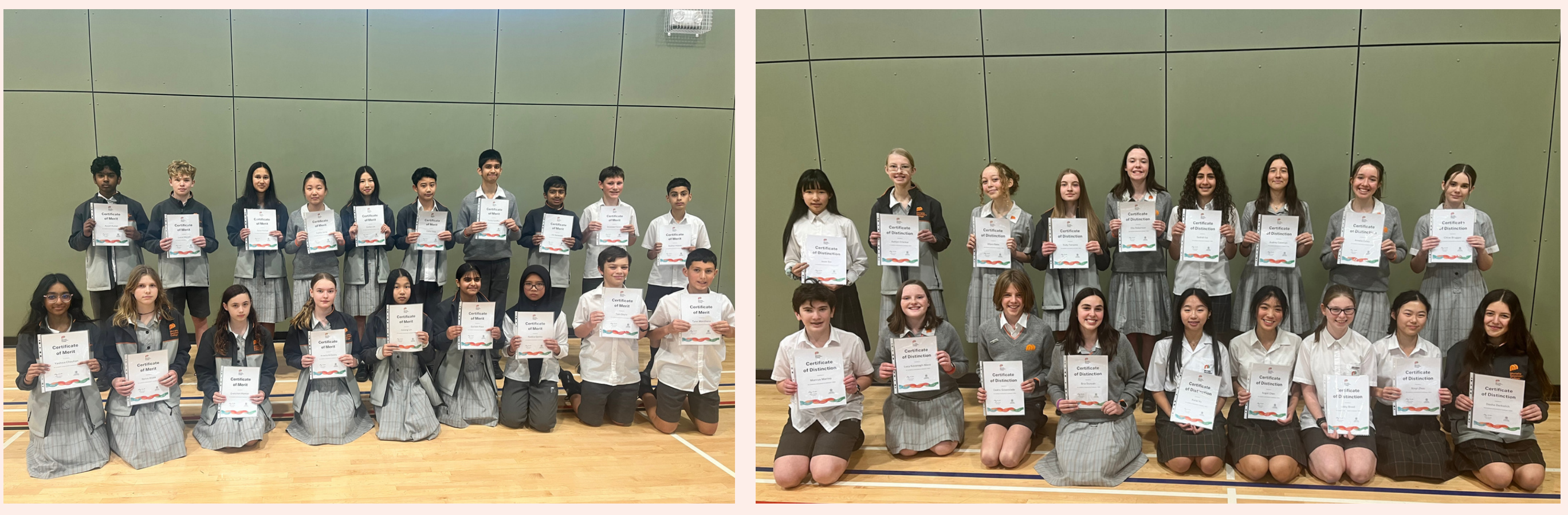
Year 7 Merit Recipients

Our talented year 7 students recently participated in the prestigious da Vinci Decathlon at St Peter's Girls' School. This academic competition challenges young minds across a variety of disciplines, including Art and Poetry, Mathematics, and Engineering, with this year's theme being 'Utopia.' In preparation for the event, our team of ten students attended several workshops led by our leadership team to hone their skills and develop effective team strategies. We are incredibly proud of their self-direction and independence. Their hard work and dedication paid off, as they secured 2nd place in the Ideation category! Congratulations to all involved.