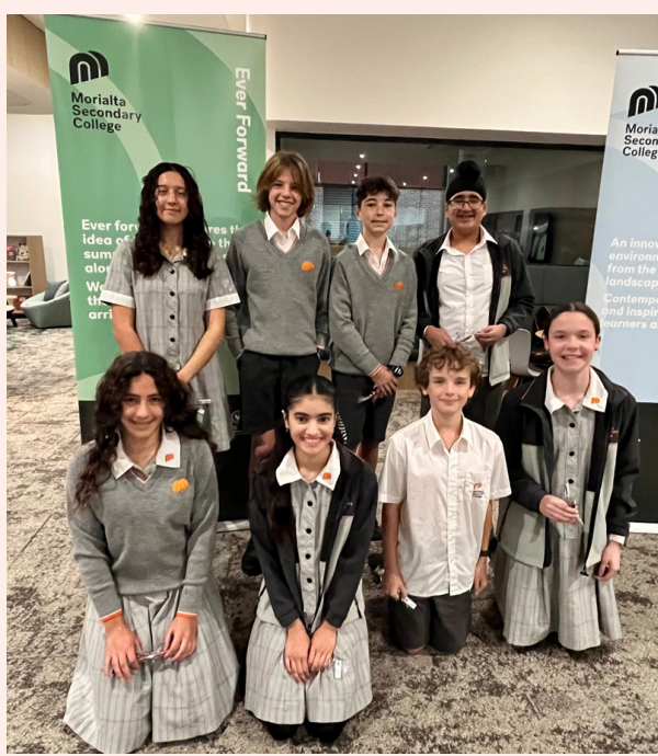
Year 8 House Leaders