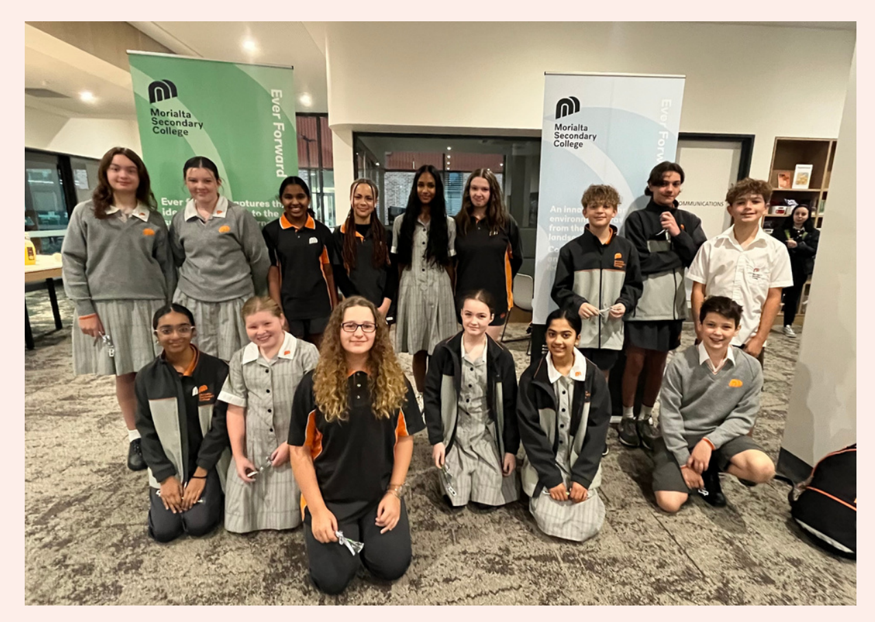
Year 7 Student Voice Council