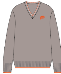
KNITTED SWEATER CUSTOM KNIT | LOGOS EMBROIDERY FABRIC: POLY COTTON ORANGE S BATCH 161 GREY 024 BATCH 258