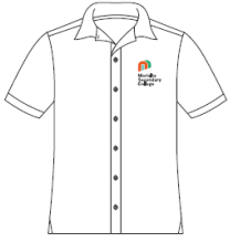
UNISEX SHORT SLEEVE SHIRT MIDFORD | WHITE | LOGOS EMBROIDERY NOTES: SIDE SPLIT, STRAIGHT HEM