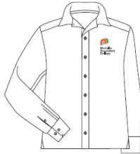
UNISEX LONG SLEEVE SHIRT MIDFORD | WHITE | LOGOS EMBROIDERY NOTES: SIDE SPLIT, STRAIGHT HEM