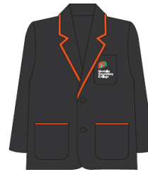
BLAZERS LOGOS EMBROIDERY