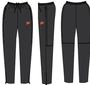
P664 GYM PANTS CHARCOAL STRETCH MICROFIBRE LOGO EMBROIDERY