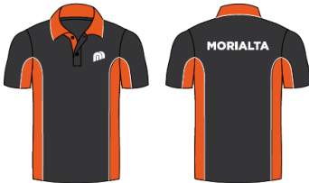
NEW GYM POLO P7 | CUT & SEW PMS 1026 C PMS 447 C WHITE