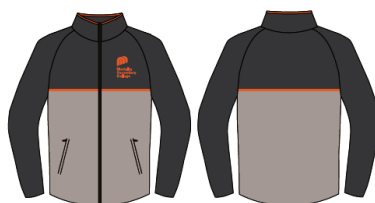
NEW SOFTSHELL JACKET CUSTOM P7 | LOGOS EMBROIDERY