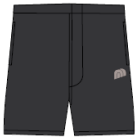
TAILORED SHORTS MIDFORD | DARK GREY | LOGOS EMBROIDERY