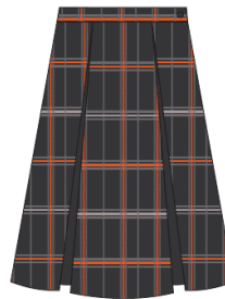
PLEATED WINTER SKIRT CUSTOM CHECK | NO LOGOS