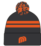
CHP81 POM POM BEANIE CUSTOM DESIGN | LOGO EMBROIDERY