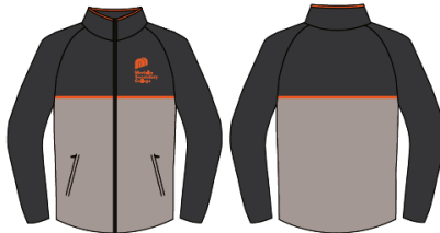
NEW SOFTSHELL JACKET CUSTOM P7 | LOGOS EMBROIDERY