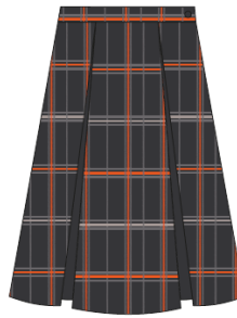
PLEATED WINTER SKIRT CUSTOM CHECK | NO LOGOS