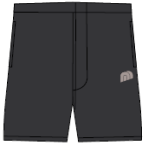
TAILORED SHORTS MIDFORD | DARK GREY | LOGOS EMBROIDERY