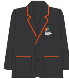
BLAZERS LOGOS EMBROIDERY