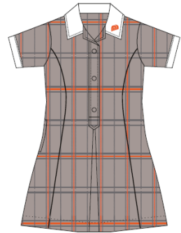
SUMMER DRESS CUSTOM CHECK | LOGO EMBROIDERY