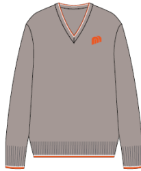
KNITTED SWEATER CUSTOM KNIT | LOGOS EMBROIDERY FABRIC: POLY COTTON ORANGE S BATCH 161 GREY 024 BATCH 258